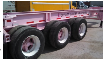
MDS Pink Chassis

our chassis pink in honor and awareness of Breast Cancer Research. The pink chassis will be hitting the road and spreading the word. We will be donating part of the proceeds for every mile traveled by the pink chassis.